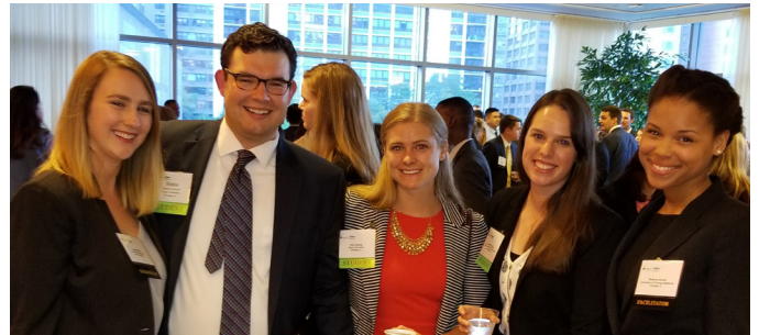
Students and alumni gathered at the fellowship event in September, hosted by the HSM Career Services Committee.