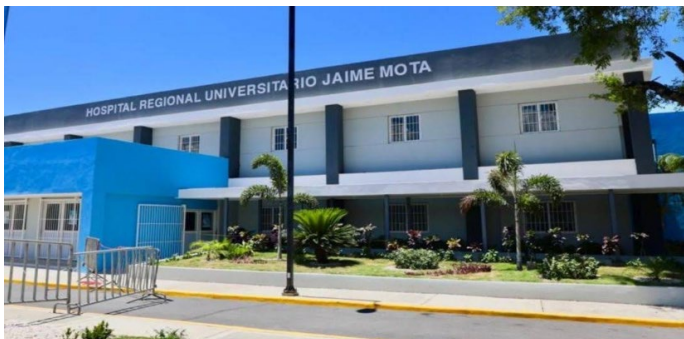
(Barahona- Hospital Regional Universitario Dr. Jaime Mota)

Barahona (if team is to be operating in Barahona): Most of our week will be spent in Barahona, a small urban city, located about an hour SW of Azua. We will be working in Hospital Regional Universitario Dr. Jaime Mota, an under-resourced hospital, with a total of 3 operating rooms. We will be staying in a comfortable hotel—shared rooms (2-3 people), somewhat reliable wifi, air conditioning.