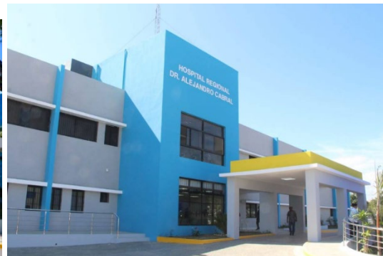
(San Juan- Hospital Dr. Alejandro Cabrera)